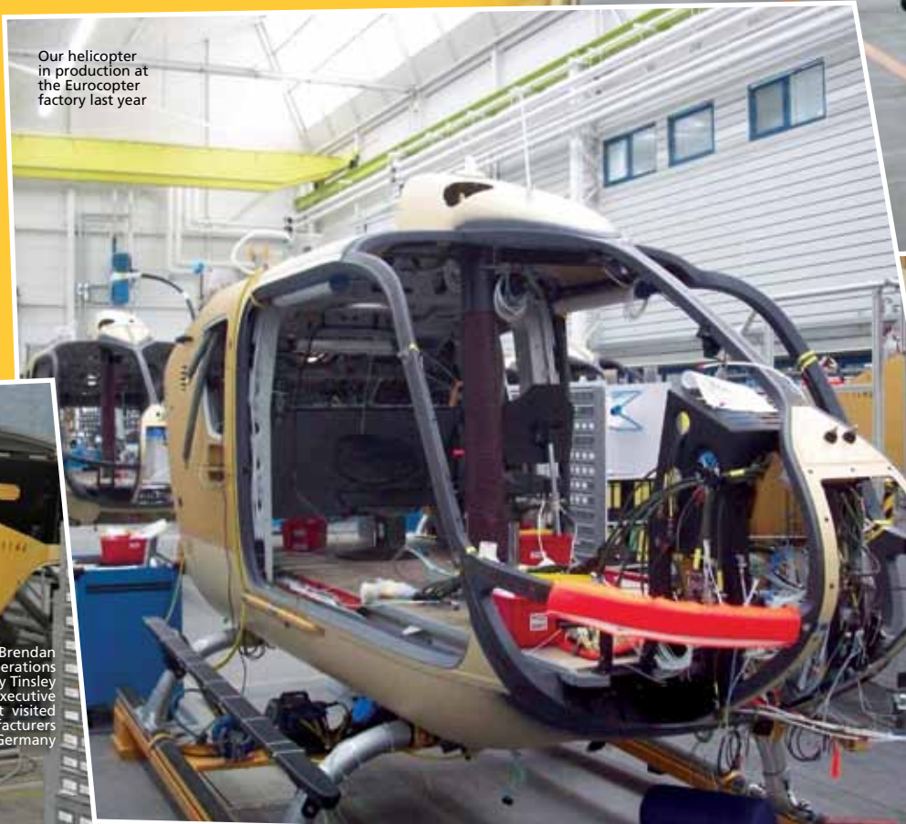
Our helicopter in production at the Eurocopter factory last year

Brendan concludes: "The new aircraft will undoubtedly help us to save more lives as it presents us with an opportunity to expand our incredible service and deliver the best possible patient care to those we airlift. But we cannot afford to rest on our laurels and although this is a milestone achievement, we need the support from the local communities we serve now, more than ever."